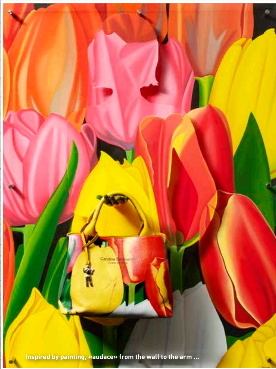
Inspired by painting, «audace» from the wall to the arm ...