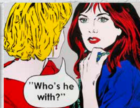
1) Wild Green 2) Atelier Roses Multicolore 3) Papillon set with 1121 diamonds 4) Capricorne 5) Ferrari 6) Who's he with? 7) Croissant